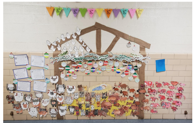
4S Best in Show - Friendly Beasts

All doors were amazing and we can’t wait to see what everyone comes up with next year!